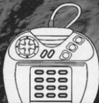
Jaguar 3 Button

The manual refers to following controls: