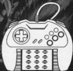
Jaguar 6 Button