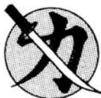
Fig. 5 Dragon Spirit Sword