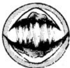
Fig. 9 Vacuum Wave (10 points)