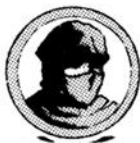
Fig. 4 1 UP