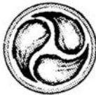
Fig. 10 Invincible Fire Wheel (20 points)