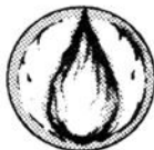
Fig. 8 Fire Wheel (8 points)